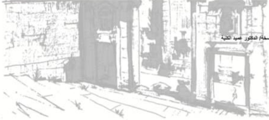
مخبر الدكتور عميد الكلية