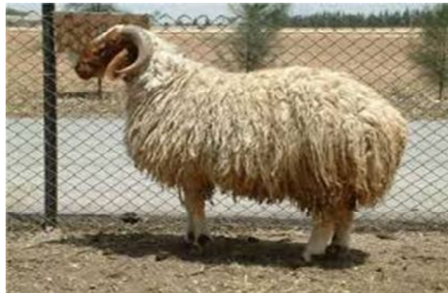
Fig 2: A typical Awassi sheep ( Ovis aries ) is the dominant fat tail sheep breed in Jordan.